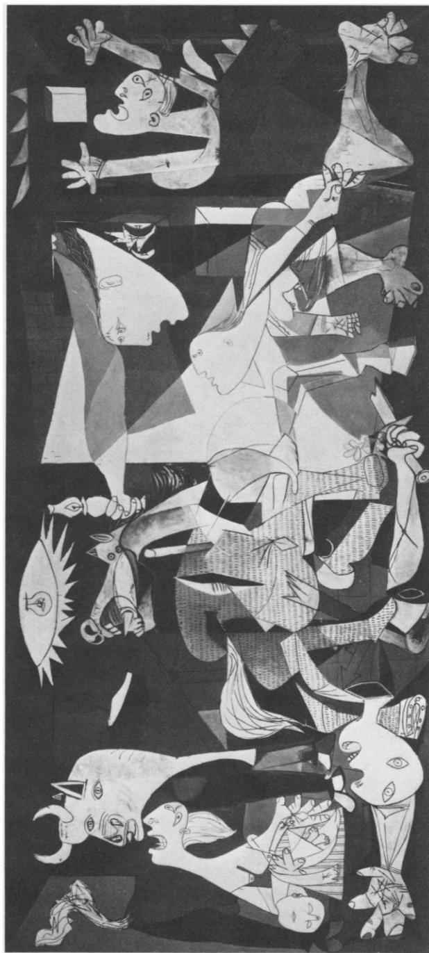
FIG. 2.—Pablo Picasso, Guernica . Museum of Modern Art, New York.